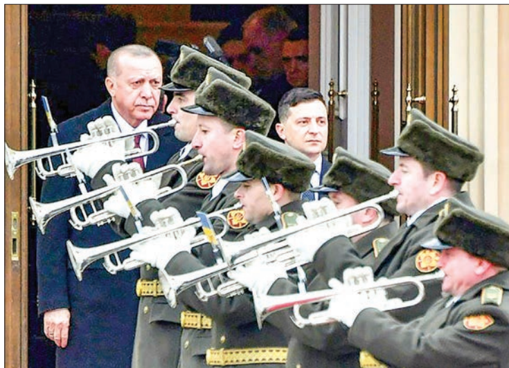
Turkish President Recep Tayyip Erdogan has pledged support for his Ukrainian counterpart Volodymyr Zelensky in the face of simmering tensions with Moscow.

But analysts think success in averting a Russian invasion could highlight Turkey's importance to the Western defence alliance and warm Erdogan's chilly relations with US President Joe Biden. "This is an opportunity for