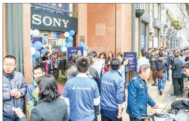
People wait for the launch of Sony's PlayStation 4 console in front of a Sony store in Shanghai on 20 March 2015.

generating gross revenue of 4.92 billion US dollars, according to the Ministry of Tourism. The country is famous for its three world heritage sites, namely the Angkor Archaeological Park, the Preah Vihear Temple and the Sambor Prei Kuk Archaeological Site.—Xinhua ■