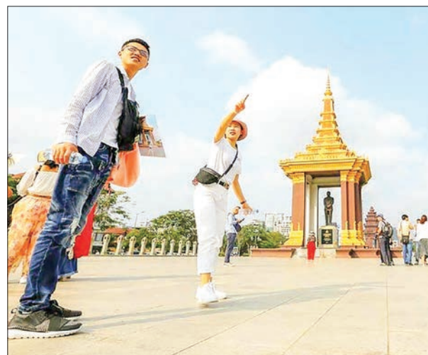
Tourism is one of the four pillars supporting the kingdom's economy.

"With our quarantine-free policy, we're confident that tourists will