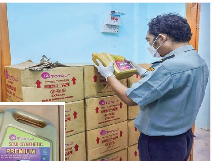
Confiscated teak and goods in Bago Region.