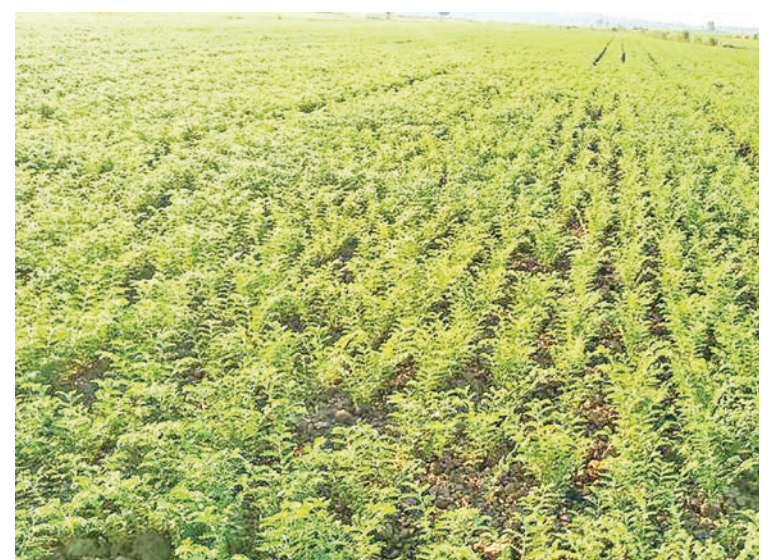
There are over 30,000 acres of winter chickpea plantation in ChaungU Township.

"The department is providing the high-quality seeds to farmers for accessing high-quality chickpea. The growers are also allowed to use only Boron and Borax to help germ-free and yield good quality crops. Likewise, the department staff are sharing the method that how to make natural antibiotics," she clarified. — Lu Lay/GNLM