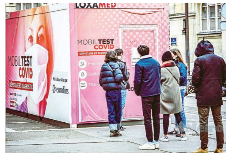
Patients wait to be tested for the novel coronavirus Covid-19 in Paris on 23 December 2021.

Motto of 75 th Anniversary Union Day 2022