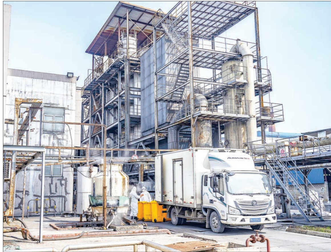
On 4 March 2020, workers handle medical waste at Wuhan Beihu Yunfeng Environmental Protection Technology Co. Ltd., which was converted from handling industrial hazardous waste to medical waste after the coronavirus outbreak in Wuhan in Hubei Province.

The analysis points out that over 140 million test kits, with a