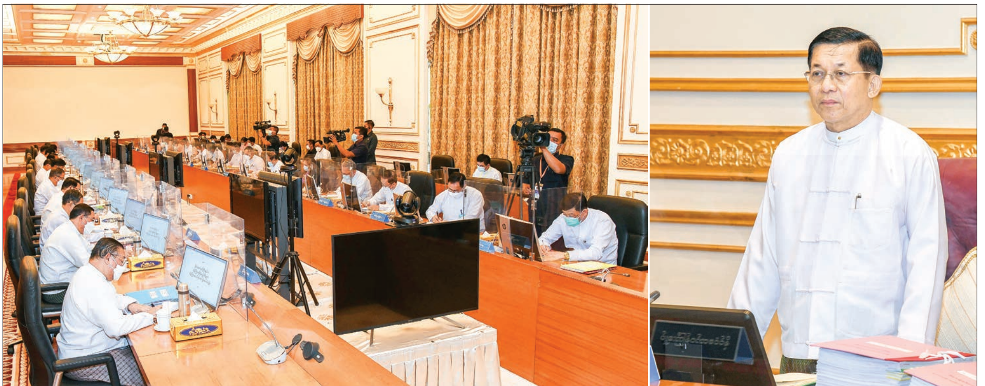
State Administration Council Chairman Prime Minister Senior General Min Aung Hlaing addresses the meeting 1/2022 of the Union Government of the Republic of the Union of Myanmar in Nay Pyi Taw on 2 February 2022.

M INISTRIES need to strive to efficiently utilize water sources in agriculture and livestock tasks, said Chairman of the State Administration Council Prime Minister Senior General Min Aung Hlaing at the meeting 1/2022 of the Union Government of the Republic of the Union of Myanmar at the office of SAC Chairman in Nay Pyi Taw yesterday morning.