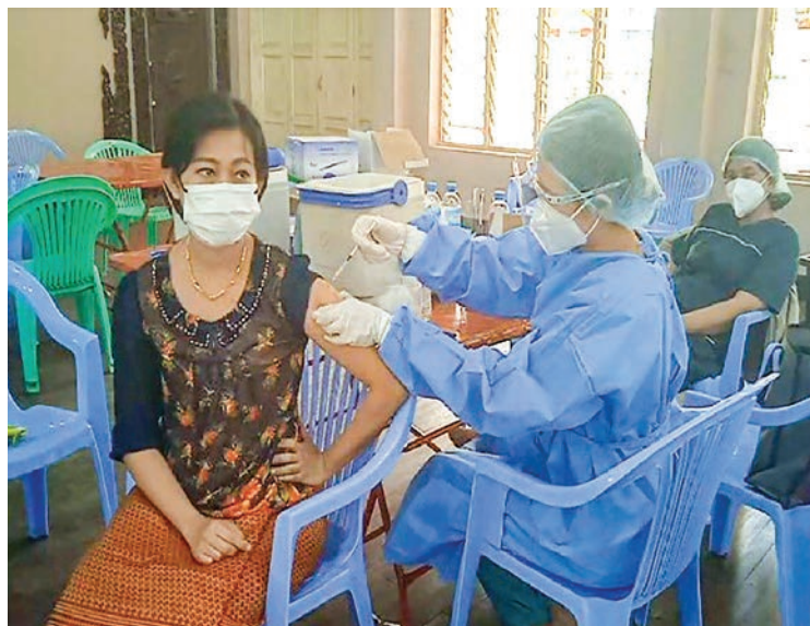
One of locals gets vaccinated against Covid-19 in Mon State.

It is reported that officials from the respective Military Commands visited the site and coordinated the necessary work.