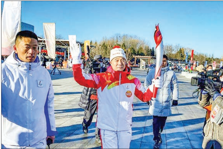
Chinese astronaut Jing Haipeng holds the Olympic torch.

THE torch relay for the 2022 Olympic Winter Games started here on Wednesday, just two days before the Games officially opens.